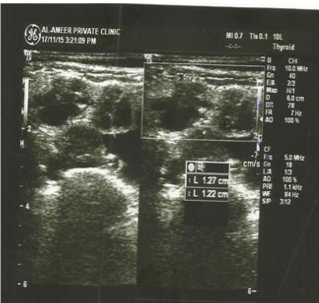
Figure 2: Multiple enlarged right supraclavicular matted LAP appears rounded with very thin fatty hilum.

FNAC: 75% of patients show nonspecific inflammatory tissues with degenerated material and hemorrhagic background.